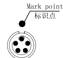
view K K向孔位排列