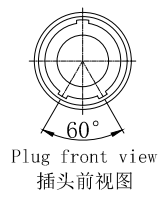
Plug front view 插头前视图