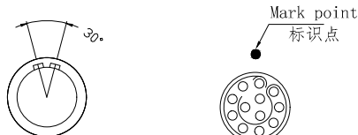
Plug front view 插头前视图

Insert Configuration/针芯配置: 1BP.312 12Low Voltage Pin Size/接触件直径: \phi 0.5\text{mm} Contact resistance接触电阻: \leq 15\text{m}\Omega Insulation resistance/绝缘电阻: 5000\text{M}\Omega (测试电压 500\text{V}(\text{DC}) ) Withstand voltage/耐压: 750\text{V}(\text{AC}) Rated working current额定工作电流: 2.0\text{A}