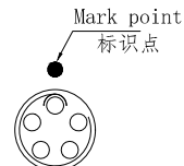
view K K向孔位排列