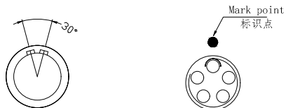
Plug front view 插头前视图