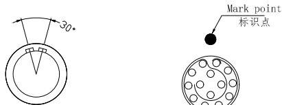
Plug front view 插头前视图