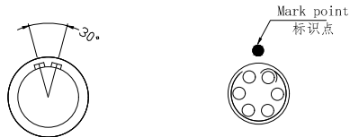
Plug front view 插头前视图

Insert Configuration/针芯配置: 1BP.306 6Low Voltage Pin Size/接触件直径: \phi 0.7\text{mm} Contact resistance接触电阻: \leq 12.5\text{m}\Omega Insulation resistance/绝缘电阻: 5000\text{M}\Omega (测试电压500V(DC)) Withstand voltage/耐电压: 1050\text{V(AC)} Rated working current额定工作电流: 7.0\text{A}