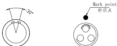
Plug front view 插头前视图

*ALL MATERIALS ARE RoHS COMPLIANT/所有材料均符合RoHS要求.