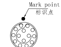
view K K向孔位排列