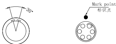
Plug front view 插头前视图