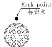
view K K向孔位排列