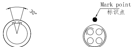
Plug front view 插头前视图

Insert Configuration/针芯配置: 1BP.304 4Low Voltage Pin Size/接触件直径: \phi 0.9\text{mm} Contact resistance接触电阻: \leq 9\text{m}\Omega Insulation resistance/绝缘电阻: 5000M \Omega (测试电压500V(DC)) Withstand voltage/耐电压: 1350V(AC) Rated working current额定工作电流: 10.0A