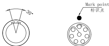
Socket front view 插座前视图