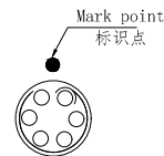
view K K向孔位排列