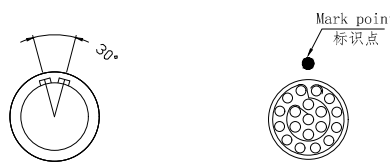
Socket front view 插座前视图