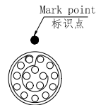
view K K向孔位排列