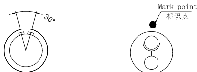
Plug front view 插头前视图

*ALL MATERIALS ARE RoHS COMPLIANT/所有材料均符合RoHS要求.