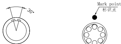
Plug front view 插头前视图