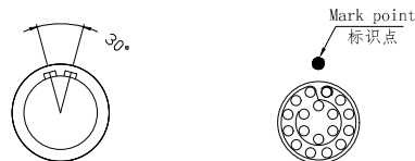
Socket front view 插座前视图