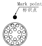
view K K向孔位排列