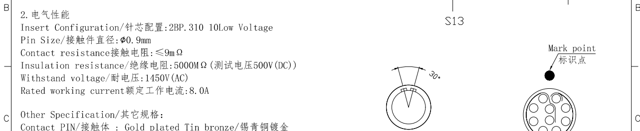
Socket front view 插座前视图