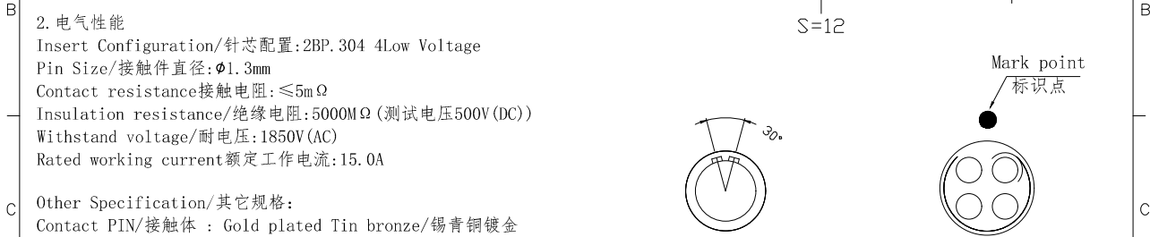
Socket front view 插座前视图