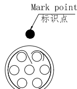
Socket front view 插座前视图