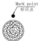
view K K向孔位排列