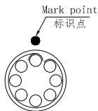
view K K向孔位排列