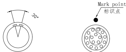
Socket front view 插座前视图