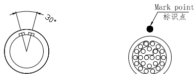
Plug front view 插头前视图