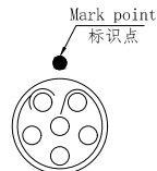
view K K向孔位排列