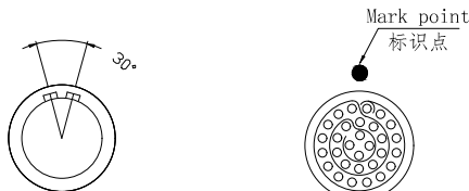
Socket front view 插座前视图