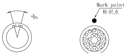
Socket front view 插座前视图