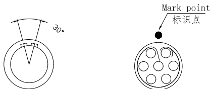
Socket front view 插座前视图