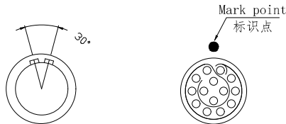
Socket front view 插座前视图