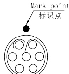
view K K向孔位排列