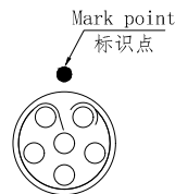
view K K向孔位排列

DRAWN BY: 绘图: P003 2024.05.28 CHECKED BY: 审核: Z01 2024.05.28 APPROVED BY: 核准: P005 2024.05.28