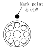
view K K向孔位排列