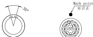
Plug front view 插头前视图