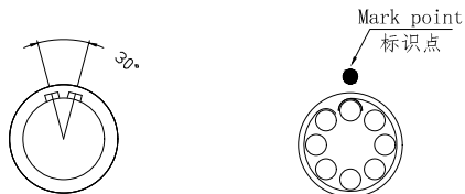
Socket front view 插座前视图