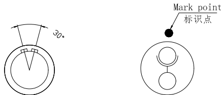
Socket front view 插座前视图