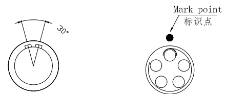
Socket front view 插座前视图