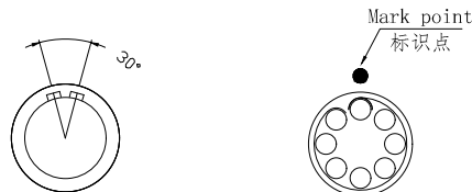
Socket front view 插座前视图