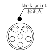
view K K向孔位排列