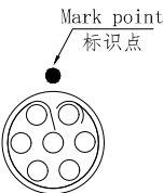
view K K向孔位排列