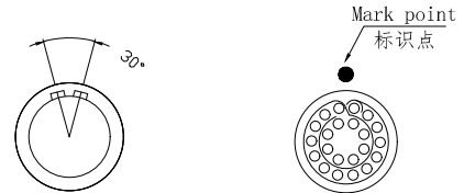
Socket front view 插座前视图