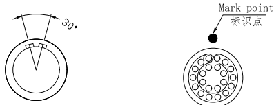
Plug front view 插头前视图