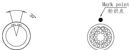
Socket front view 插座前视图