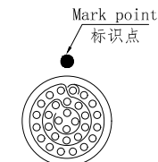
view K K向孔位排列