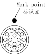
view K K向孔位排列