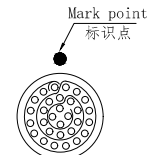
view K K向孔位排列