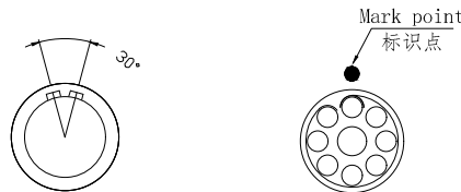
Socket front view 插座前视图