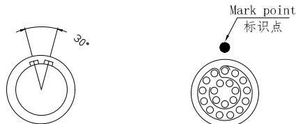
Socket front view 插座前视图

*ALL MATERIALS ARE RoHS COMPLIANT/所有材料均符合RoHS要求.